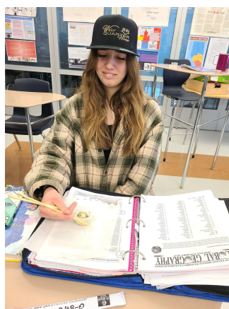
The grade 7 science class used recycled materials and their imaginations to create insulating devices