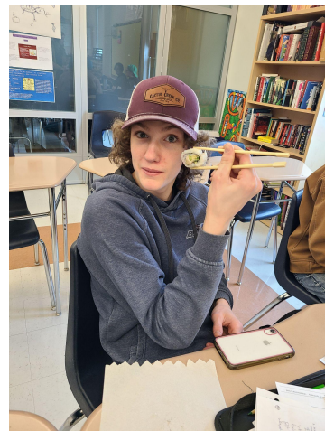
Students in Social 10-2 had a tasty lesson about Hybridization and Acculturation.